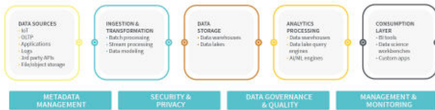
Figure 1. Modern enterprise data analytics architecture

Consider the various components of a modern enterprise data architecture today. We can decompose an analytical ecosystem into a set of vertical services that span from the producers of data through to the consumers of data and analytics, and the common horizontal services needed to support each vertical service. (See Figure 1.)